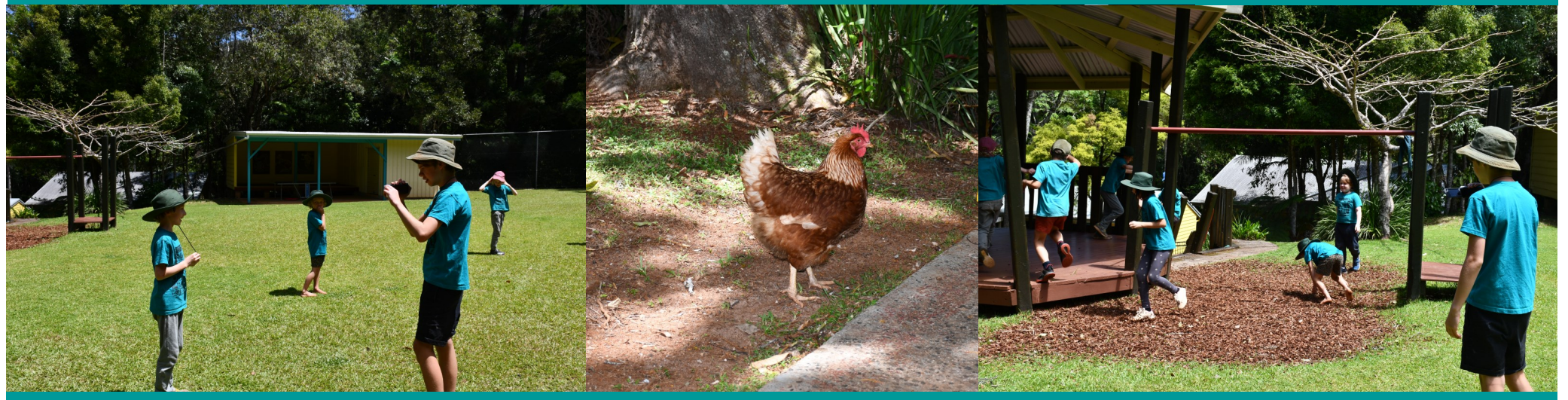
Term 4 Week 4